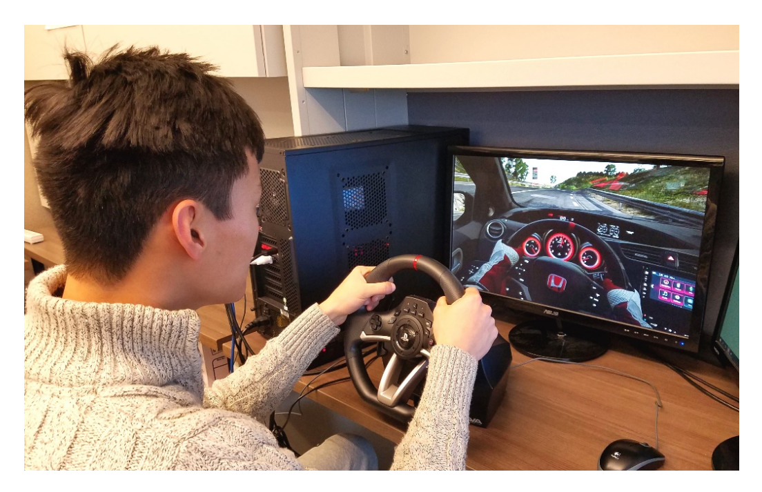
Figure 2. A participant undertaking the experiment.

After participants felt comfortable using the system, the simulation was reset and task instructions were given. Participants were told to drive normally on the correct side of the road while maintaining a driving speed between 50 mph (88 kph) and 60 mph (96 kph). They were also instructed to stay within the designated lane and that deviating from the lane would count as a driving error. Emphasis was placed on driving safely as they would in the real world and that all tasks must be completed before the course ended reaching the end of the road within the simulation.